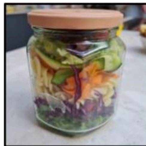
Jam jar salad