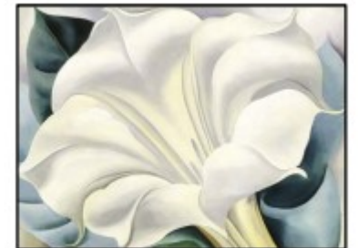
The White Flower (1932) by Georgia O'Keeffe

In art we are painting, we will examine in detail a part of a flower using magnifiers and viewfinders before sketching and then enlarging it. They will develop the techniques of overpainting and wet-on-wet, as well as make tertiary colours. They will respond to the work of artists.