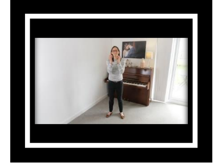
Activity 3: Wake your voice and body up with a song

Activity 2: Use kitchen instruments to play along to the 'Star Wars' theme using rhythm notation. Star Wars Theme Song Rhythm Video- Level 2 - YouTube