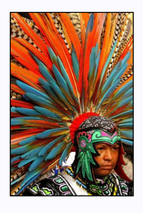
Can you design and make other accessories to go on the front of your feather head dress?