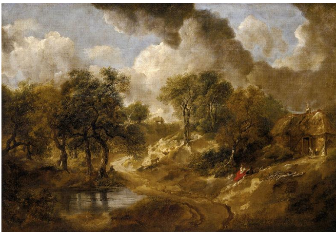
Thomas Gainsborough 'Landscape in Suffolk'

In PE we will be building our stamina and core strength with circuits exercises, skipping and quicksticks.